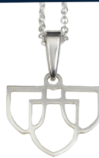
Necklace $50 each