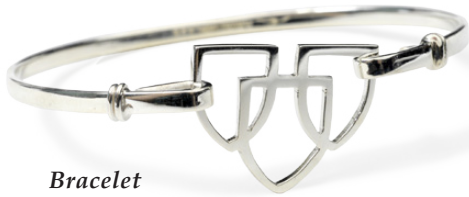
Bracelet $50 each