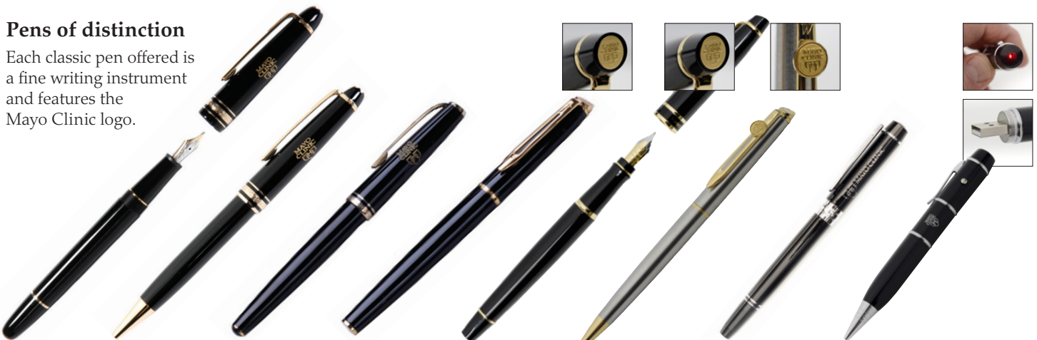
Mont Blanc Fountain Pen $500 each

Each classic pen offered is a fine writing instrument and features the Mayo Clinic logo.