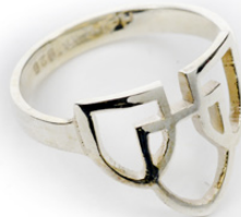
Ring Sizes 5.5 to 9.5. $40 each