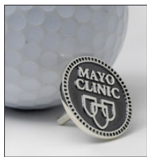
Golf Ball Marker $25 each