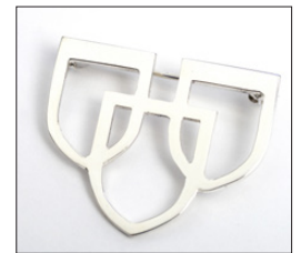
Brooch Approximately 1" x 1" in size. $45 each