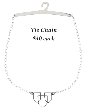
Tie Chain $40 each