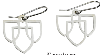
Earrings $30 pair